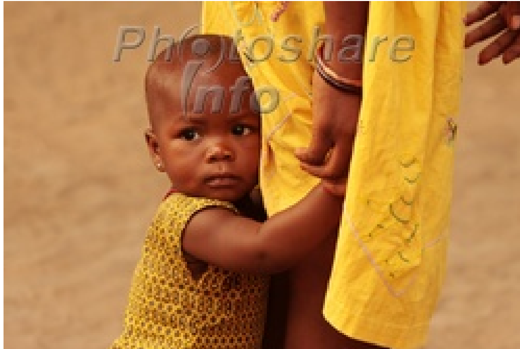
A child with her mother in a camp for Liberian refugees in Accra, Ghana.

Note: Include caption for best practice.