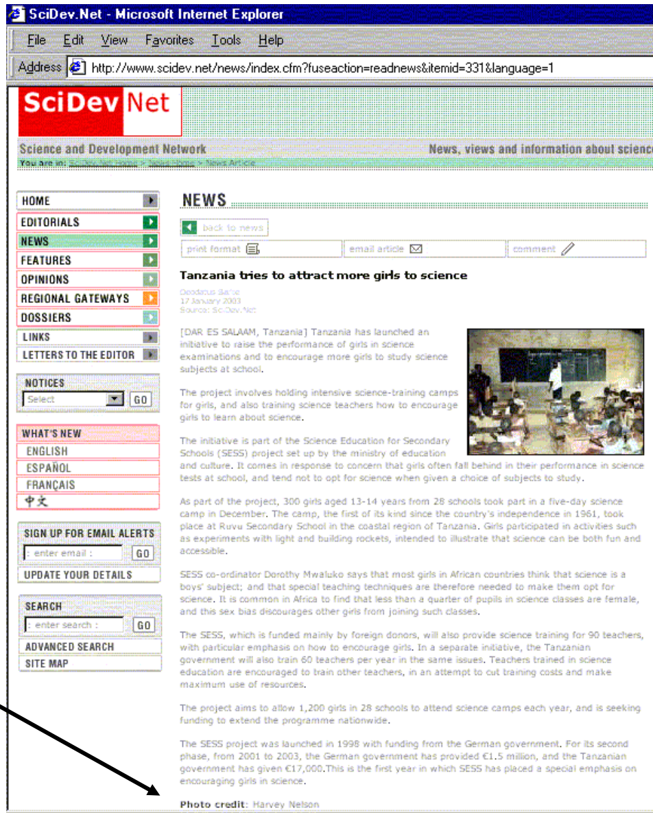
Photo credit appears at the bottom of the page.